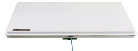
50 Feet Ceiling